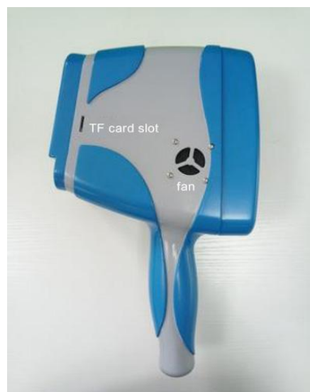
Fig.1 ATF2500 Handheld Ultraviolet Fluorescence Oil Contamination Spectrometer