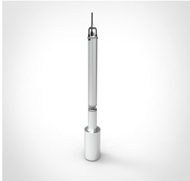
Fig.2 ATF2500ONL online installation, RS485/Modbus output oil pollution remote sensing detector